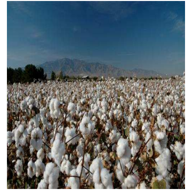
The cotton fields were worked in daily by the men and slaves.

Education to Georgia was very important and common. Most children who were educated were boys. The boys were taught to read and write while the girls did all the cleaning and cooking. Most boys were taught at home by a paid teacher. After school the boys would work in the fields with their fathers and plant crops. Most of the time the men hired slaves to help them work in the cotton fields.