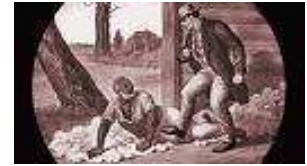
Slaves were beaten when they did not please their masters.

Women played a big role in colonial life. They would perform many daily tasks such as: cleaning clothes, making candles, cooking meals, tending the fire, making soap, and tending gardens. Sometimes they would need to perform unusual tasks for women such as building fences, cutting down trees, and plowing fields. Natives did not play as big roles in South Carolina's culture as in other colony's culture, but they did play a part. Most of South Carolina's land was bought from the natives. Some of the natives were hostile towards the settlers, but most were not. Slavery played a big role in South Carolina's culture