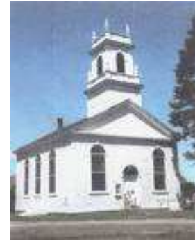
Above is a modern day Puritan church. Below is a painting of a colonial Puritan church

The settlers of colonial South Carolina did not want to completely sever their ties to the Church of England. They believed that the only religion that should be tolerated was a perfect Puritan one. They believed that with everyone practicing the same religion, everyone would be in God's good graces. Even though the Puritans believed this, other people still practiced other religions. Some of these religions are: Protestant, Judaism, Quaker, and Roman Catholic. There was not much religious influence over the government in South Carolina. The preachers stuck to the church and did not get involved in political decisions.